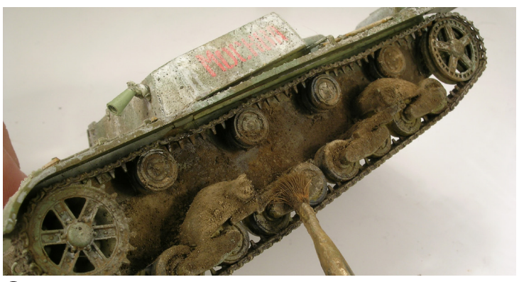
We can create streaking effects to replicate the effects of rain and condensation.