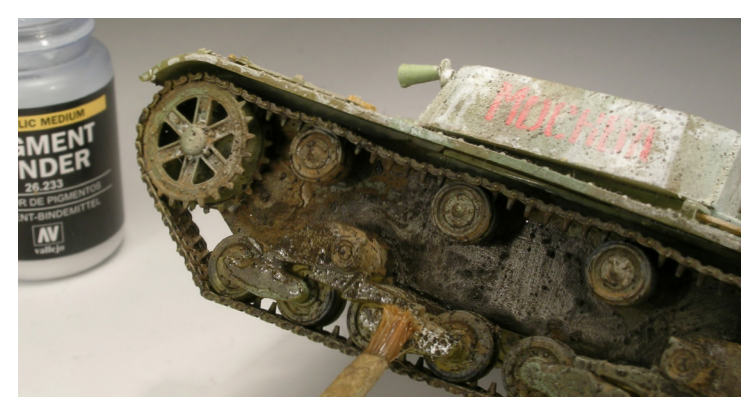
Now we can apply the pigment directly to the moistened surface of the kit.