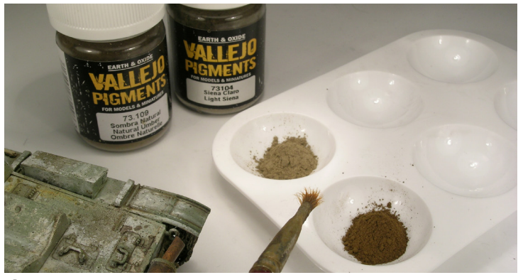
3 We can mix and blend the pigments in a random fashion, using different shades.